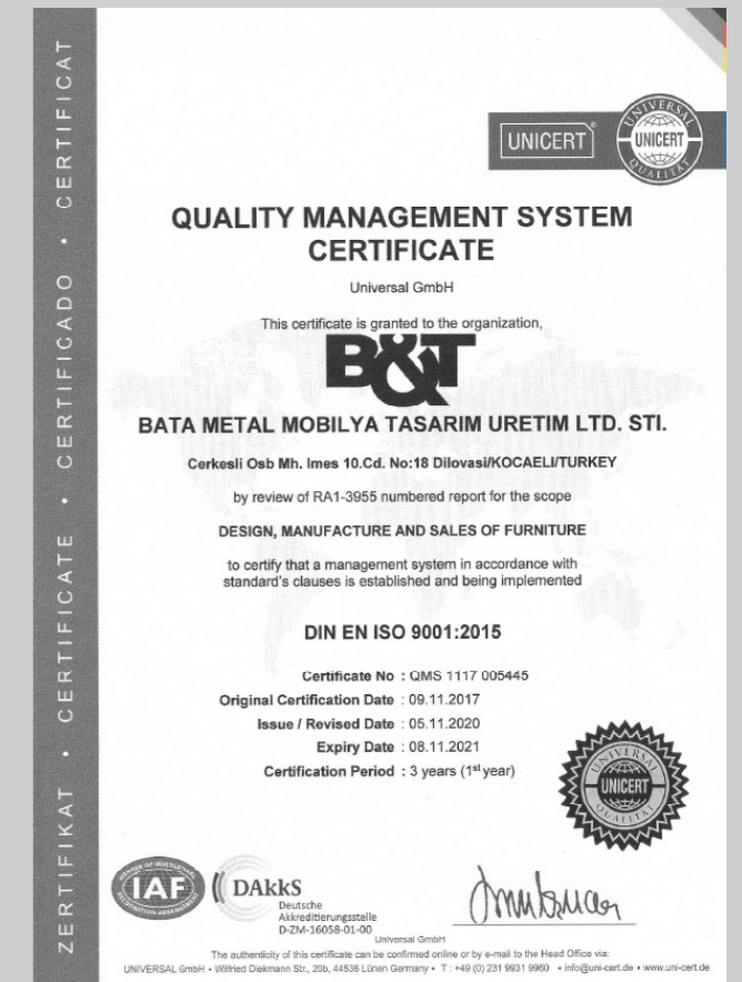
TS EN ISO 9001